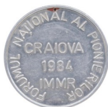
Fig. 37. National Forum of Pioneers

Aluminium. 50 mm. Craiova. PC. (Fig. 37).