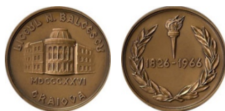
Fig. 1. “Nicolae Bălcescu” High School Anniversary