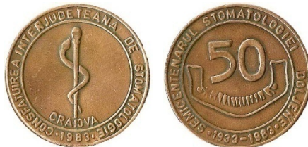
Fig. 31. Inter-County Conference of Dentistry