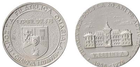
Fig. 22. Branch A.F.R. Dolj Anniversary

Rv. FILIALA A.F.R. DOLJ LA 20 DE ANI DE ACTIVITATE 1958-1978 (Branch A.F.R. DOLJ to 20 Years of Activity 1958-1978) . Circular written legend. In field, the County Council building under which there is a rectangular cartridge, with the incision, V. BULUCEA , the mayor of Craiova. Anodized aluminium. 50 mm. Mint State. PC. (Fig. 22).