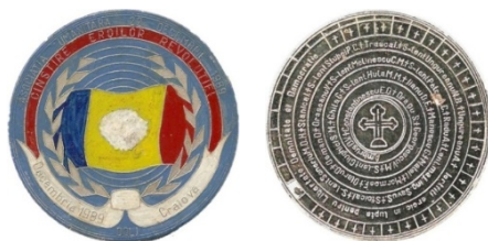
Fig. 56. Humanitarian Association "December 22, 1989"

Activity medals from 1990 to 1997. Autonomous State Mint, Bucharest, 1998 (hereinafter AM-MS, 1998); RCMR, p.469, no.3922. (Fig. 56).