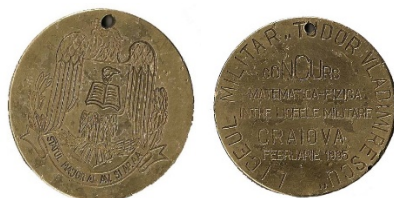
Fig. 70. Military High School “Tudor Vladimirescu” Craiova