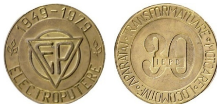
Fig. 25. Electroputere Plants Anniversary

Bronze patina. 70 mm. Craiova. PC. (Fig. 25).