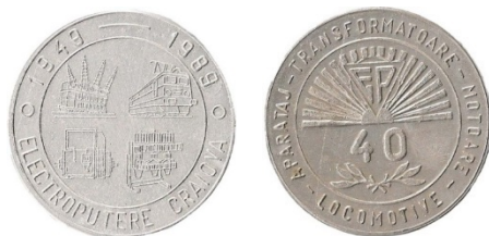
Fig. 54. Electroputere Plants Anniversary

Aluminium. 70 mm. Craiova. PC. (Fig. 54).