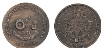
Fig. 3. Centenary of The Industrial High School for Agricultural Mechanics

Obv. SOCIETATEA NUMISMATICĂ ROMÂNĂ (Romanian Numismatic Society). Circular written letter. In the field, the society logo, limited by a linear circle: the bust of the goddess Minerva in the profile to the left, with a helmet and a breastplate, holding a torch in her right hand. Under this, written semicircular, the anniversary years are Roman numerals: MCMIII–MCM LXXIII , and beneath, on a scarf, the LXX year.