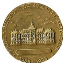
Fig. 23. Branch A.F.R. Dolj Anniversary

Aluminium. 50 mm. Mint State. PC. (Fig. 23).