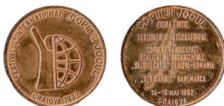
Fig. 57. International festival “Children and the game”