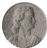
Fig. 6. “Maria Tănase” National Contest and Festival