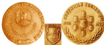
Fig. 4. Romanian Numismatic Society Anniversary