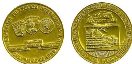
Fig. 55. Philatelic Exhibition “Poland – România – Bulgaria”

Anodized Aluminium. 60 mm. Author C. Dumitru. Mint State. PC. (Fig. 55).