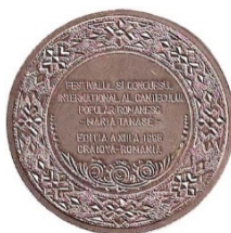
Fig. 68. Festival and International Competition “Maria Tănase”

AM-MS, 1998, p.73, no.5; RCMR, p.537, no. 4597. (Fig. 68).