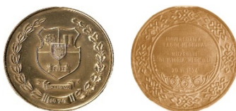
Fig. 7. The Foundation of The Museum of the History of Medicine

Anodized Tombac. 60 mm. Mint State. PC. (Fig. 7).