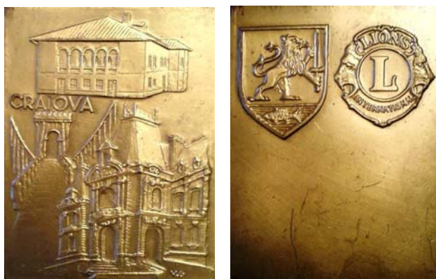
Fig. 59. Lions International Craiova