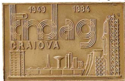
Fig. 35. Anniversary of The Trust General Contracting and Industrial Construction

Tombac patina. 80 × 50 mm. Mint State. PC. (Fig. 35).