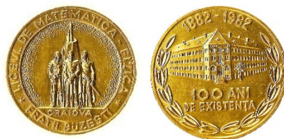
Fig. 27. Centenary of The High School “Frații Buzești” (Buzești Brothers)

Anodized aluminium. 60 mm. Mint State. PC. (Fig. 27).