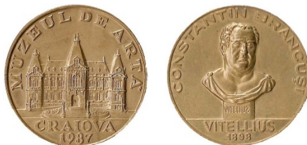
Fig. 46. World Heritage Values in Craiova - VITELLIUS 1898.

Tombac. 60 mm. Mint State. PC. (Fig. 46).