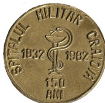
Fig. 28. Military Hospital Anniversary

Bronze. 70 mm, molded. Craiova. PC. (Fig. 28).