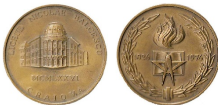
Fig. 18. “Nicolae Bălcescu” High School Anniversary

Patina Tombac. 60 mm. Mint State. PC. (Fig. 18).