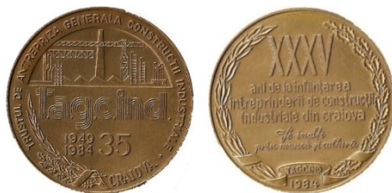
Fig. 34. Anniversary of The Trust General Contracting and Industrial Construction

Anodized Tombac. 60 mm. Mint State. PC. (Fig. 34).