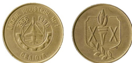
Fig. 44. Aeronautics Industrial High School Anniversary