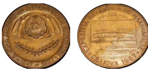
Fig. 52. National Maximaphily Exhibition

Obv. EXPOZIȚIA BILATERALĂ DE FILATELIE (Bilateral Philatelic Exhibition) , Semicircular written legend at the top, linear ROMÂNIA - BULGARIA , written over two stamps, one on the left represents the first Romanian stamp, and on the right, a first Bulgarian stamp. Under the stamps, writing linear 4 DECEMBRIE 1988 , in a row, and below, semicircular CRAIOVA .