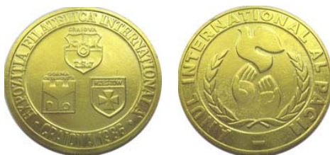
Fig. 45. Philatelic Exhibition România – Bulgaria – Poland