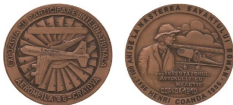
Fig. 42. Romanian Scientist Henri Coandă Birth Centenary

Obv. In field there is the emblem and the University building from Craiova. The legend is written circular: UNIVERSITATEA DIN CRAIOVA (University of Craiova) . And on top of it the years: 1966 – XX – 1986 .