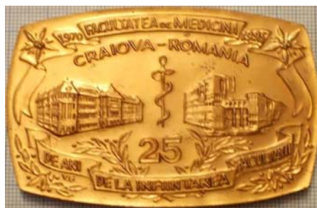
Fig. 66. Faculty of Medicine Anniversary

RCMR, p. 533, no.4552; AM – MS, 1998, p.79, no.142. (Fig. 66).