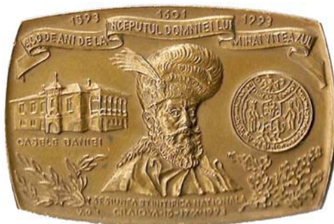
Fig. 60. National Scientific Conference dedicated to beginning of the reign of Mihai Viteazul

Tombac. 54 × 80 mm. Engraver Vasile Gabor. RAMS. 100 copies. RCMR, p. 490, no. 4132. (Fig. 60).