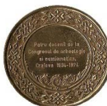
Fig. 9. Anniversary of The Congress of Numismatics and Archaeology

Anodized Tombac. 60 mm. Mint State. PC. (Fig. 9).