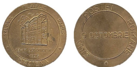
Fig. 64. Philatelic Show “Ramuri” (“Branches”)

Obv. I(nstitutul) C(ercetări) M(ecanice) și E(lectro) T(ehnice) - 1995, separated by two laurel branches. In the inner linear circle: LIT - LMP1975 CRAIOVA 1995. Circular written legend around a circular diagram written in a linear circle.