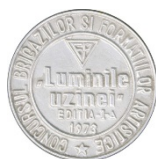
Fig. 5. Competition “Luminile uzinei” (“Plant’s lights”)

Aluminium. 50 mm. Private Collection (hereinafter referred to as PC). (Fig. 5).