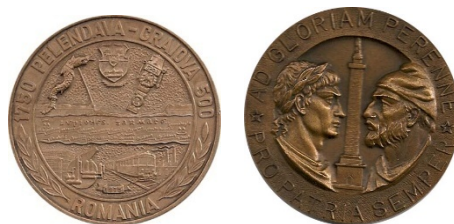
Fig. 13. Anniversary of Pelendava and Craiova

Bronze patina. 60 mm. Author N. Culluri. Mint State. PC. (Fig. 13).