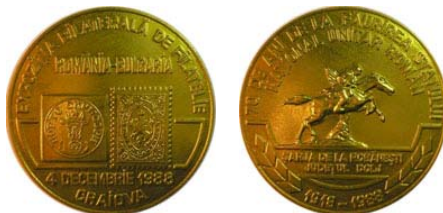
Fig. 53. Philatelic Exhibition România – Bulgaria