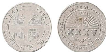
Fig. 36. Electroputere Plants Craiova Anniversary

Aluminium. 70 mm. Craiova. PC. (Fig. 36).