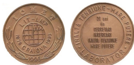
Fig. 65. Laboratory High Voltage and High Power Anniversary