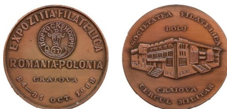
Fig. 58. Philatelic Exhibition “România-Poland”