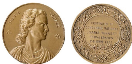
Fig. 17. National Contest and Festival “Maria Tănase”