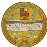
Fig. 16. Anniversary of Pelendava and Craiova

Aluminium enamelled. 32 mm. Author N. Culluri. Mint State. PC. (Fig. 16).