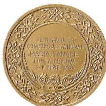
Fig. 24. National Contest and Festival “Maria Tănase”