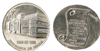
Fig. 43. University of Craiova Anniversary

Chromium Nickel. 60 mm. Craiova. PC. (Fig. 43).