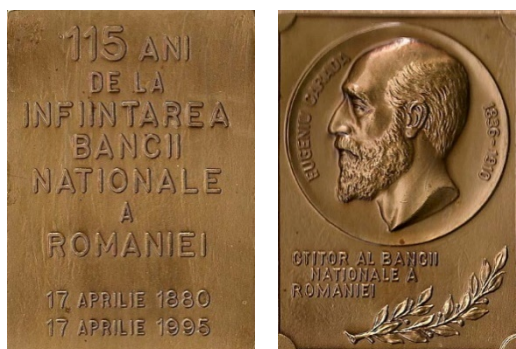
Fig. 69. 115 Years of the establishment of The National Bank of Romania 17 April 1880 17 April 1995

AM-MS, 1998, p. 75, no. 49; RCMR, p. 540, no. 4624. (Fig. 69).