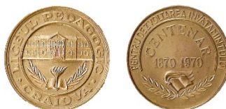
Fig. 2. Centenary of The Pedagogical High School

Onoriu Stoica, Medals of Craiova, 1750 Pelendava-500 Craiova, Craiova, 1971, p. 9 (hereinafter: Medals of Craiova).