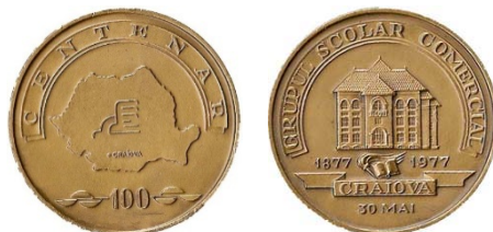
Fig. 20. Centenary of The Commercial School Group

Bronze. 50 mm. Mint State. PC. (Fig. 20).