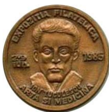
Fig. 40. Philatelic Exhibition “Art and Medicine” Ion Țuculescu