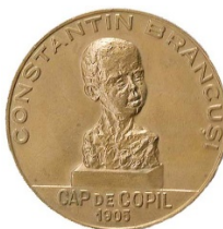
Fig. 47. World Heritage Values in Craiova - CAP DE COPIL 1905.

Tombac. 60 mm. Mint State. PC. (Fig. 47).