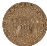
Fig. 8. The Foundation of The Museum of the History of Medicine

Anodized Tombac. 60 mm. Mint State. PC. (Fig. 8).