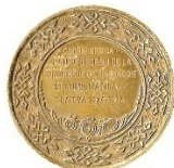
Fig. 10. Anniversary of The Congress of Numismatics and Archaeology

Anodized Tombac. 60 mm. Mint State. PC. (Fig. 10).