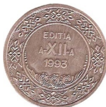
Fig. 63. Contest Festival of Romanian Folk Song “Maria Tănase” (XII Edition)