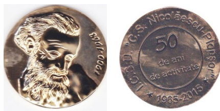
Fig. 71. ICSU “C.S. Nicolăescu-Plopșor” *1965-2015*

Anodized Tombac. 60 mm. RAMS. 100 copies. CP. (Fig. 71).