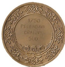
Fig. 15. Anniversary of Pelendava and Craiova

Patina Tombac. 60 mm. Mint State. PC. (Fig. 15).