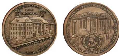
Fig. 30. Centenary of the birth of Dr. Victor Gomoiu. Museum of the History of Medicine

Medalii privitoare la istoria românilor. Repertoriu Cronologic, București, 1999, p. 412, no. 3471, (hereinafter RCMR). (Fig. 30).