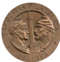
Fig. 14. Anniversary of Pelendava and Craiova

M. Ioniță, Medalii și plachete românești, Buletinul Societății Numismatice Române (hereinafter BSNR), LXX-LXXIV, 1976-1980, nr. 124-128, p. 502, fig. 13. (Fig. 14).