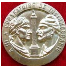
Fig. 21. National Meeting of Insignography

Tombac. 26,5 mm. State Mint. PC. (Fig. 21).