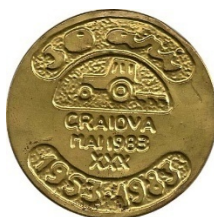
Fig. 32. Agricultural Machinery Enterprise Anniversary