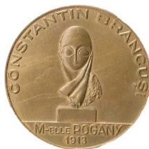
Fig. 51. World Heritage Values in Craiova - M-elle POGANY 1913 .

Tombac. 60 mm. Mint State. PC. (Fig. 51).