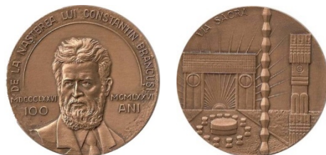
Fig. 19. Constantin Brâncuși's Birth Centenary

Rv. Against the background of the rising sun there are visible component parts of the complex carved in the city Tg. Jiu and above on the left, VIA SACRA . Bronze patina. 60 mm. Engraver Ștefan Grudinschi. Mint State. PC. (Fig. 19).