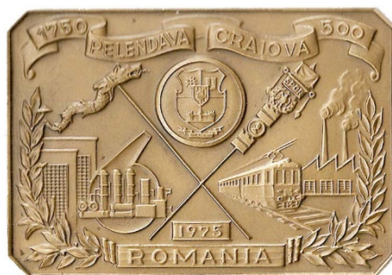
Fig. 12. Anniversary of Pelendava and Craiova

Patina Tombac and silver plated tombac. 90 × 60 mm. Author N. Culluri. Mint State. PC. (Fig. 12).