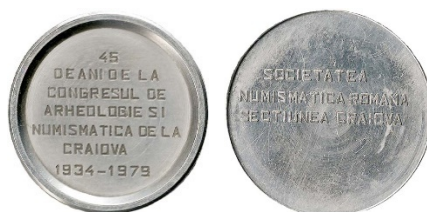
Fig. 26. Anniversary Congress of Numismatics and Archaeology

Aluminium. 70 mm. Craiova. PC. (Fig. 26).