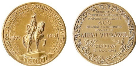
Fig. 61. National Scientific Conference dedicated to beginning of the reign of Mihai Viteazul