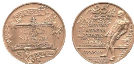
Fig. 67. Faculty of Medicine Anniversary

AM-MS, 1998, p. 79, no.141; RCMR, p. 533, no.4551. (Fig. 67).