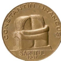
Fig. 49. World Heritage Values in Craiova - SĂRUTUL 1907 .

Tombac. 60 mm. Mint State. PC. (Fig. 49).