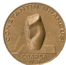
Fig. 50. World Heritage Values in Craiova - COAPSA 1909 .

Tombac. 60 mm. Mint State. PC. (Fig. 50).