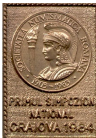
Fig. 38. The First National Symposium of Numismatics

Tombac. 40 × 25 mm. Mint State. PC. (Fig. 38).