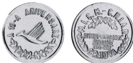
Fig. 29. The Aircraft Company Anniversary