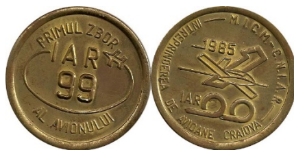
Fig. 39. The first flight of IAR99, built in Craiova

Anodized tombac. 50 mm. Craiova. PC. (Fig. 39).