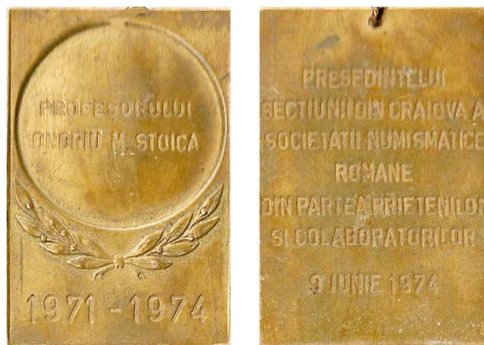
Fig. 11. Anniversary of The Section Craiova a Romanian Numismatic Society 1975

Patina Tombac. 50 × 35 mm. Mint State. PC. (Fig. 11).