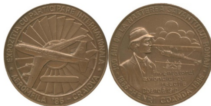
Fig. 41. Romanian Scientist Henri Coandă Birth Centenary

Anodized Tombac. 60 mm. Mint State. PC. (Fig. 41).