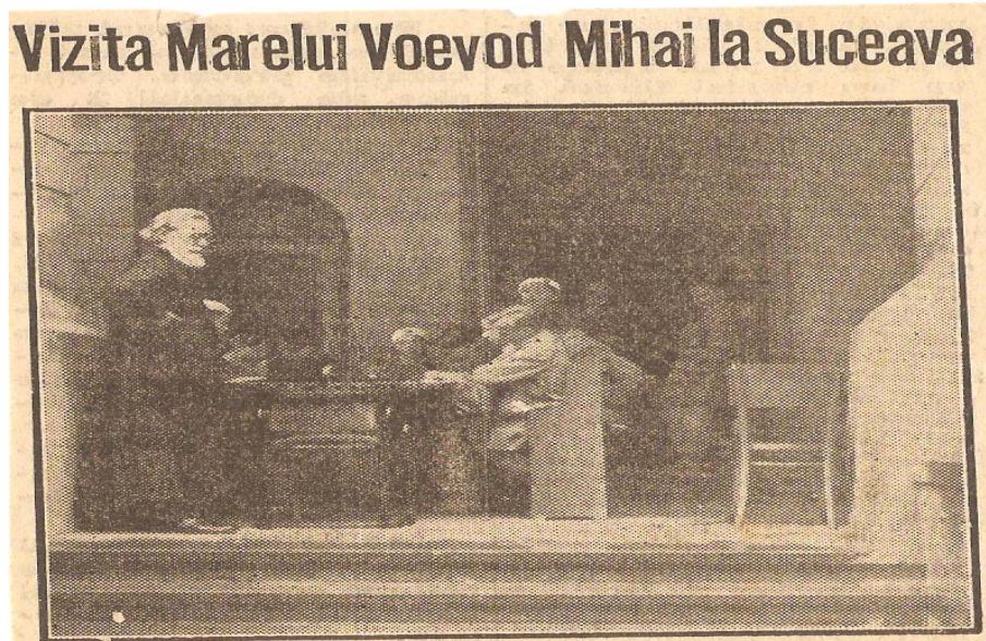
Fig. 4 – Mirăușilor Church. Front view. The Great Voivode with his colleagues discussing about religion.